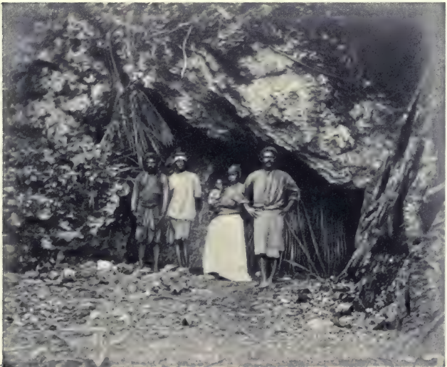
THE CAVE AT LOANATIT